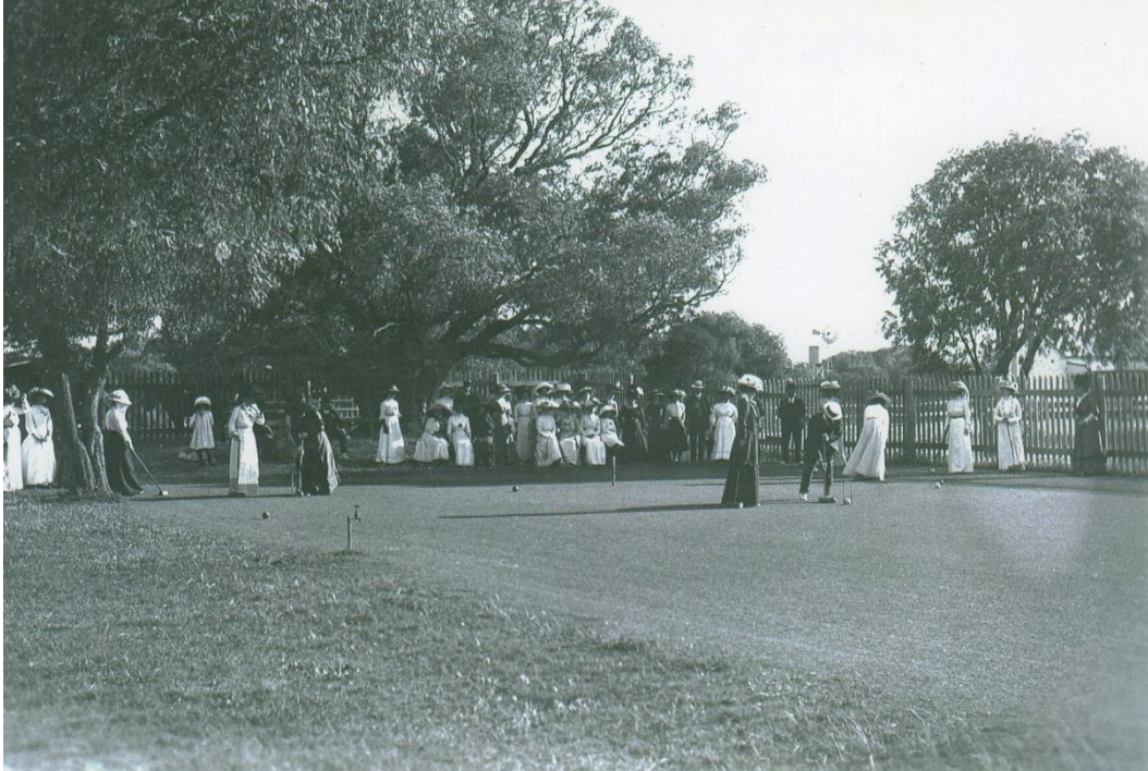
Busselton Croquet Club 1909