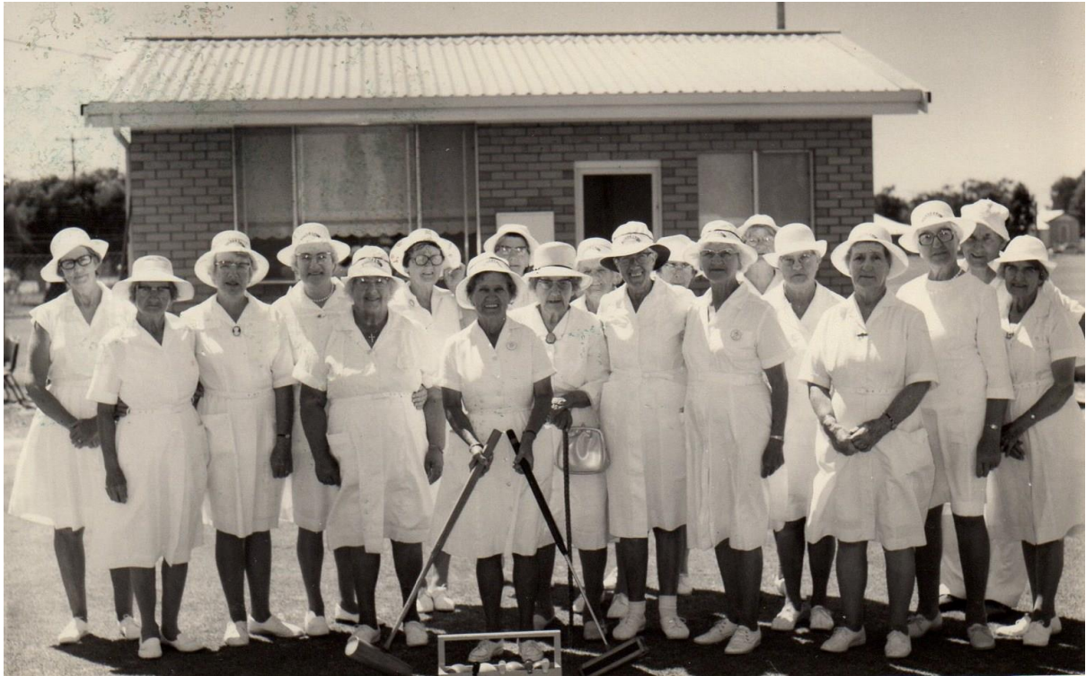
Members at the club house opening