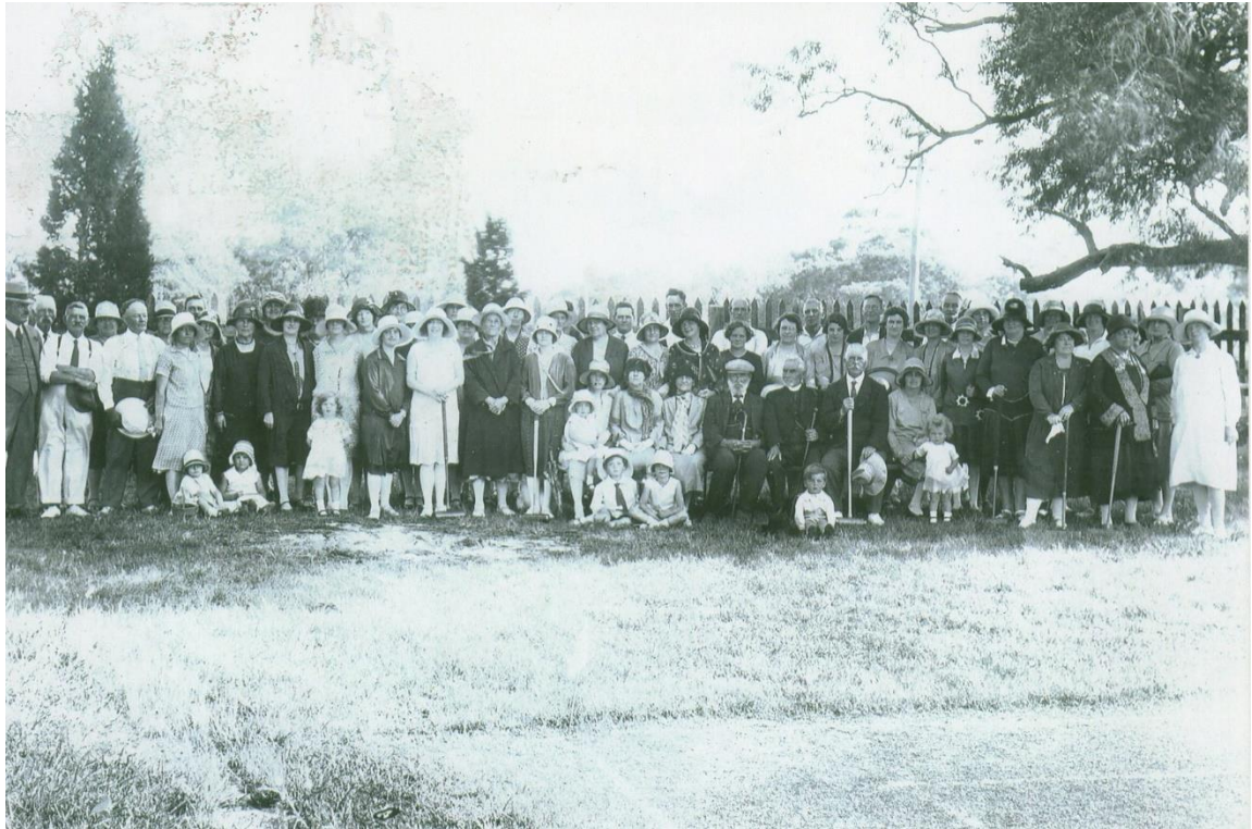
Busselton Croquet Club 1929 WA Centenary

In 1929 the Western Australia Centenary year, the Club held a Centenary carnival